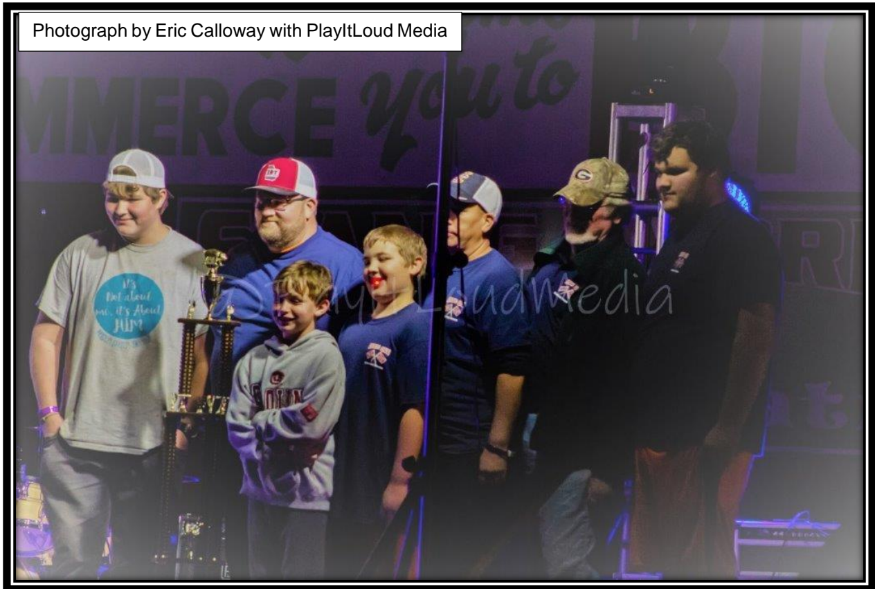
2018 BIG PIG JIG® Grand Champions Dixie Que