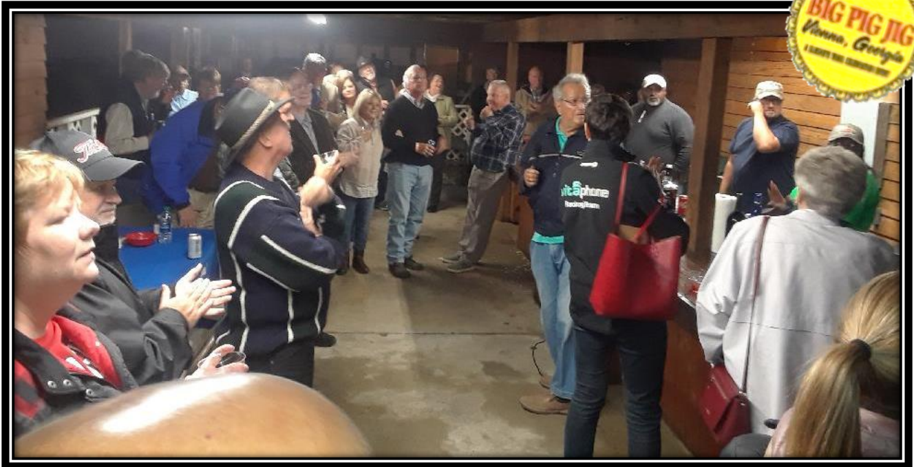
Friday night guests at the City of Vienna booth